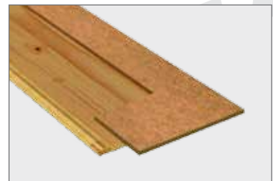
Under-structure with MDF board.

Length: 2200mm Width: 209mm m 2 /board: 0.46m 2 Boards/bundle: 4 m 2 /bundle: 1.84m 2 Bundles/pallet: 27 m 2 /pallet: 49.68m 2 Weight/pallet: 517.6kg